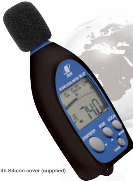
View with Silicon cover (supplied)